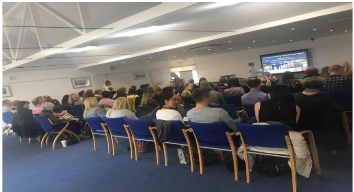
Clinical Forum: Risk – Intimate Partner Violence September 2018

Some highlights from Forums over this reporting period: